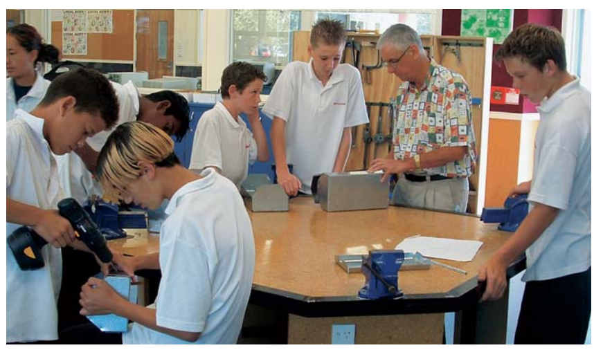
Technology in action at Melville High School.

The high level of concern over status also reflected the problems around the G3 salary group, which had affected many technology teachers. "Clearly they have been badly affected and insulted by the ADR decision in 2002. Even the subsequent development of pathways for some technology