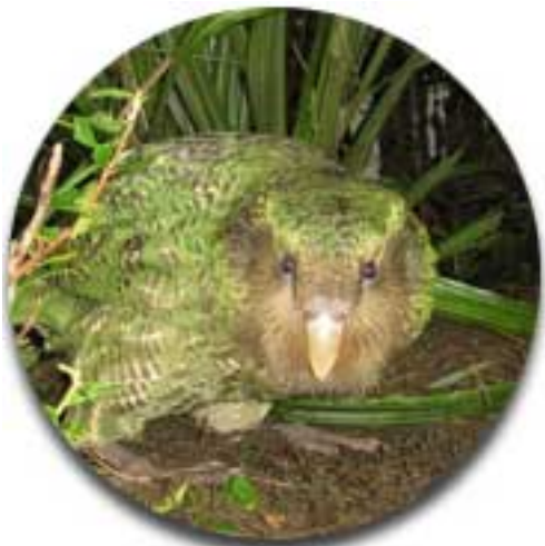
Petroleum and Minerals

Along with trips about takahē, whio, kiwi, shorebirds and birds of prey LEARNZ visited this special kākāpō sanctuary - on six occasions - to follow the plight of this adorable but seriously threatened ancient parrot