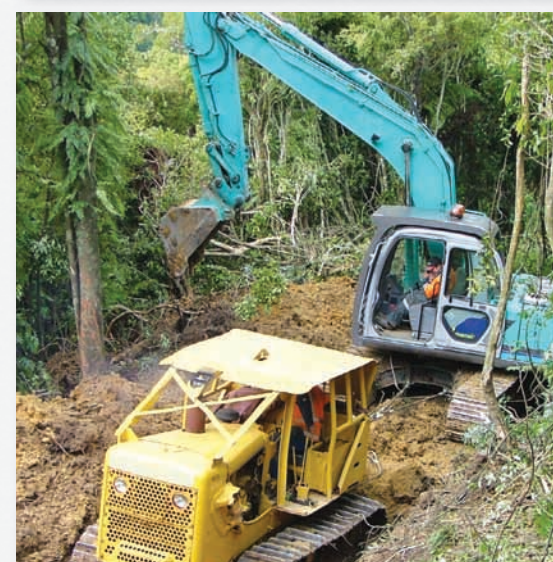
Burying the Bandit ►