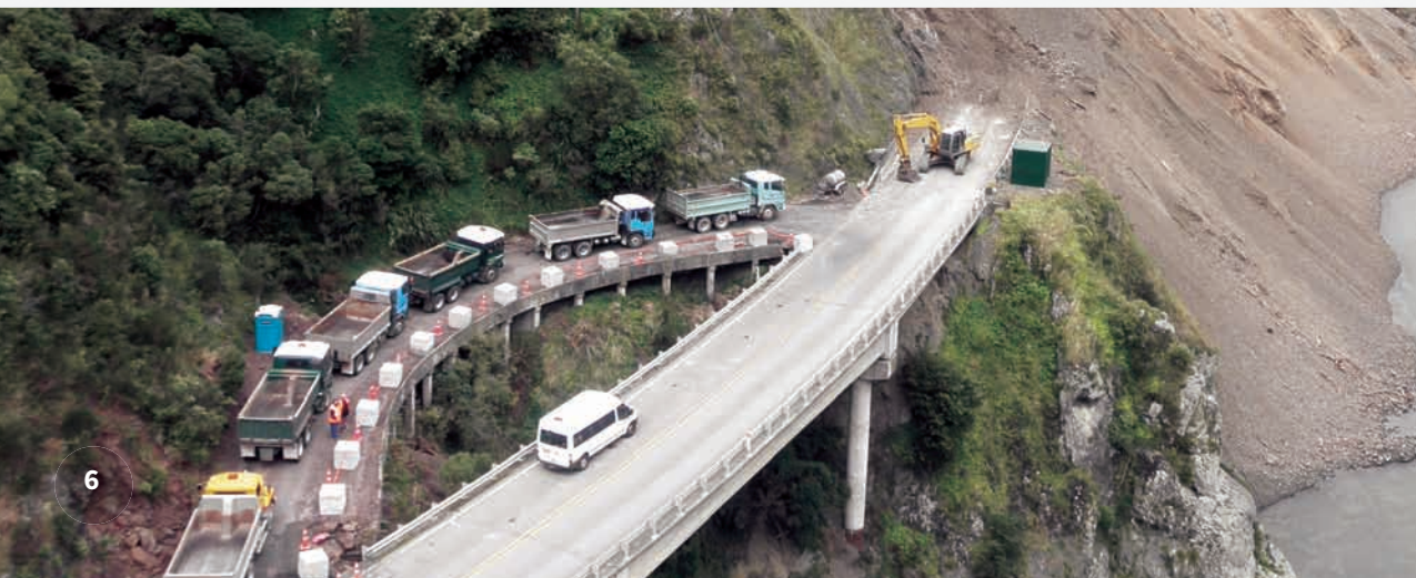
The third and fourth benches are cut into the hillside. ▼

The third and fourth benches were dug into the hillside, and after that, the Bandit was no longer needed. This meant that the machines had to keep going and dig all the way down to the road. There was no other way off the hillside. And so the digging continued. By the time the slip was finally cleared, 370 000 cubic metres of rock and earth had been trucked away. If that doesn’t mean anything ... imagine Wellington’s stadium filled with so much dirt that it spills out over the roof.