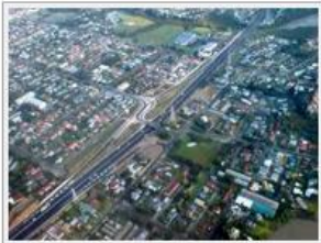
New Zealand roads.