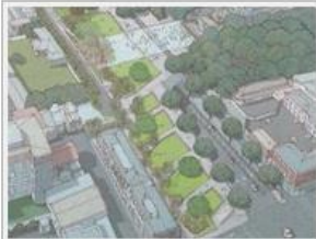
The National War Memorial Park.