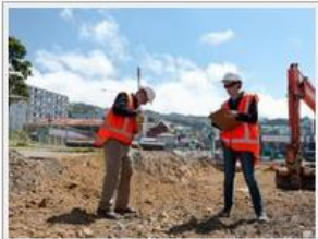
Memorial Park construction.