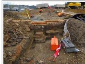
Managing the impacts on people and the environment.

New Zealand Roads Memorial Park; Not just a roading project The First World War and New Zealand's Involvement