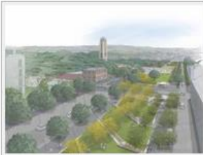
Memorial Park: not just a roading project.