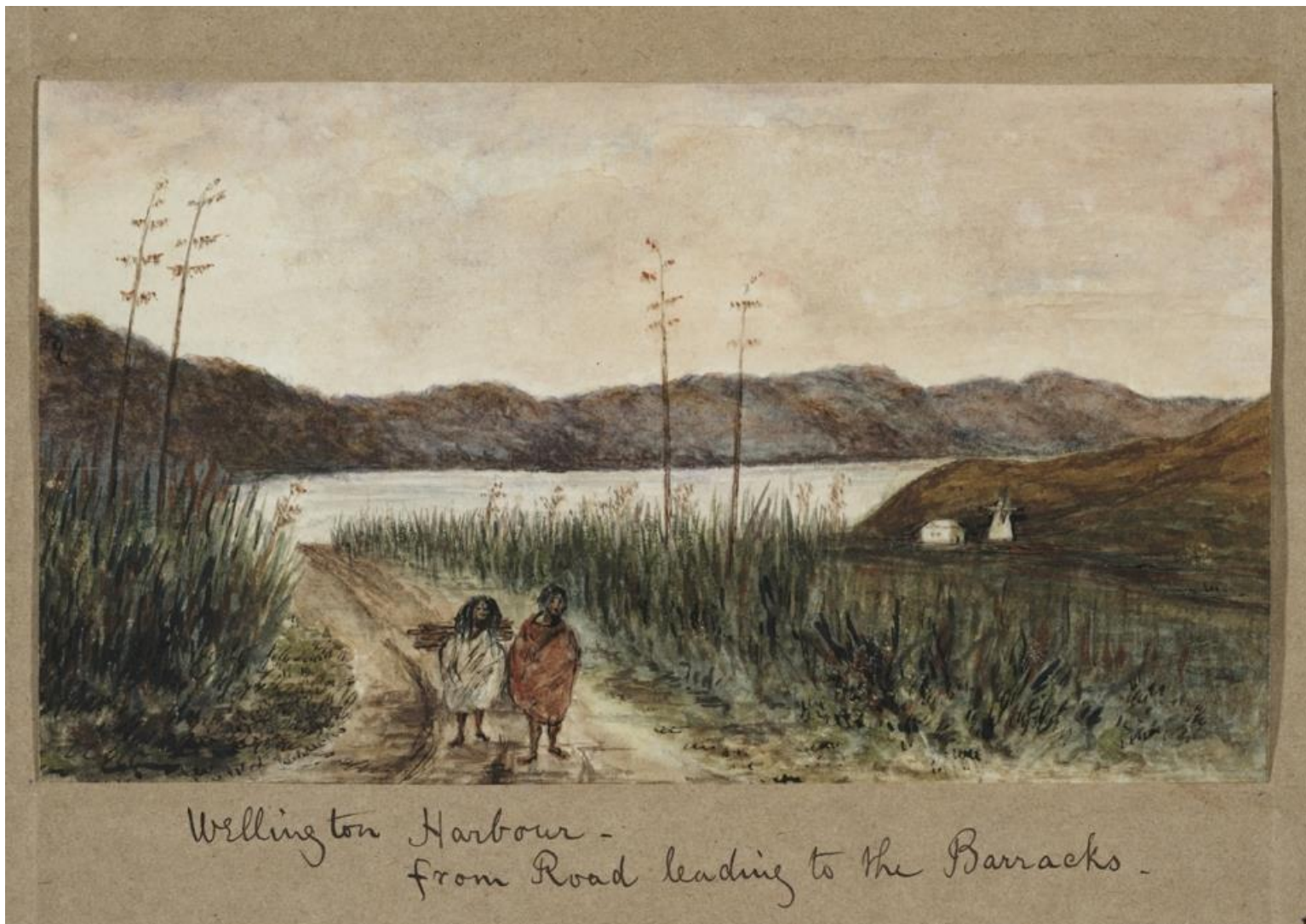
Wellington Harbour - from Road leading to the Barracks -

Memorial Park will be built at the National War Memorial site in Mount Cook/Pukeahu. Māori lived in this area long before European settlement, Pukeahu means sacred hill. The military built army and police barracks here along with prisons, so this area was seen as an important place for defence.