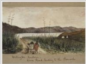
The history of Mount Cook/Pukeahu.