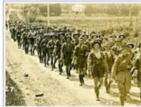
The First World War and New Zealand's involvement.