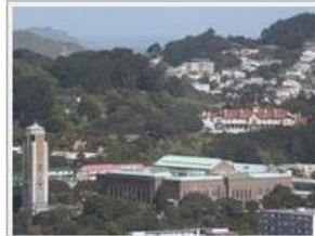
The benefits of New Zealand Memorial Park.