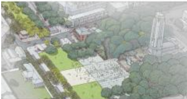
The National War Memorial Park and the tunnel below